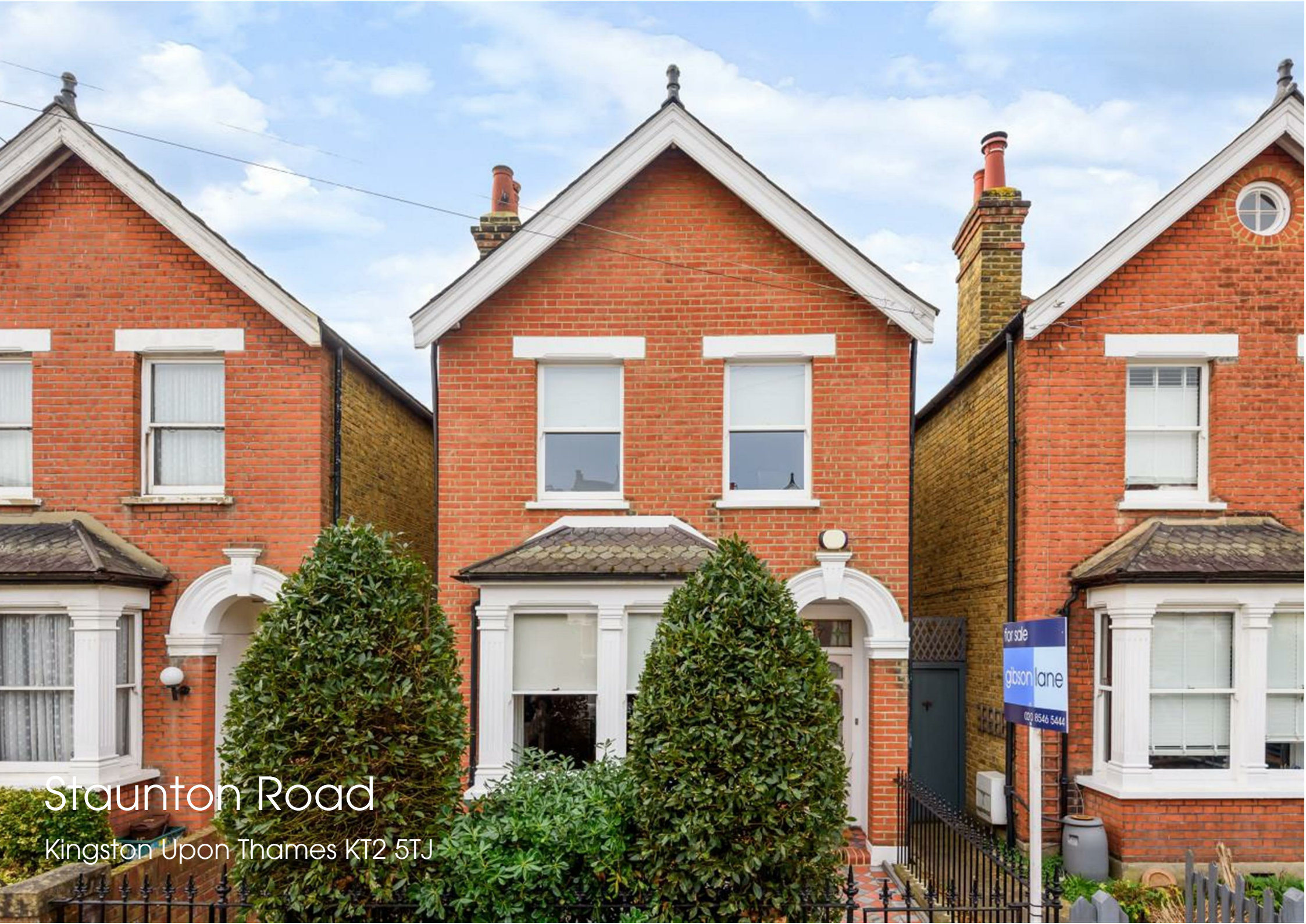
Staunton Road Kingston Upon Thames KT2 5TJ